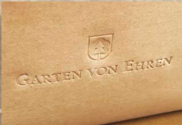
An example of a stamped advertisement